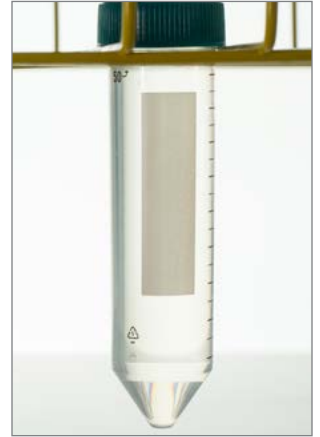
Figure 1: PET Pellets Before and After Digestion